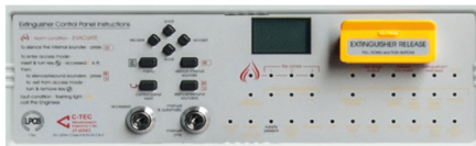
CAN-FSS-C Container Type