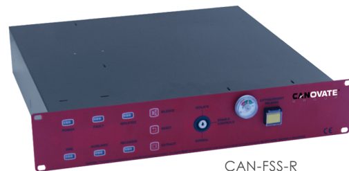
CAN-FSS-R Rack Type

Canovate Solutions do not need extensive design calculations, room strengthening or costly wiring. Installation, Commissioning and maintenance costs are all reduced in a more cost effective solution.