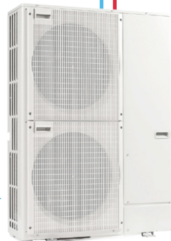
Outdoor DX Unit