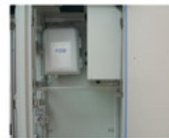
4 19" Active Equipment Section