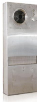
5 Top Mountable Heat exchanger