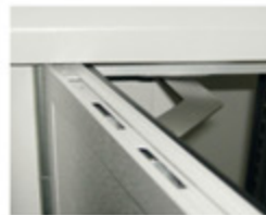
1 Double Skin Door