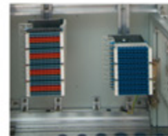
2 MDF Section