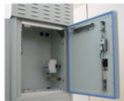
3 Power Box Section